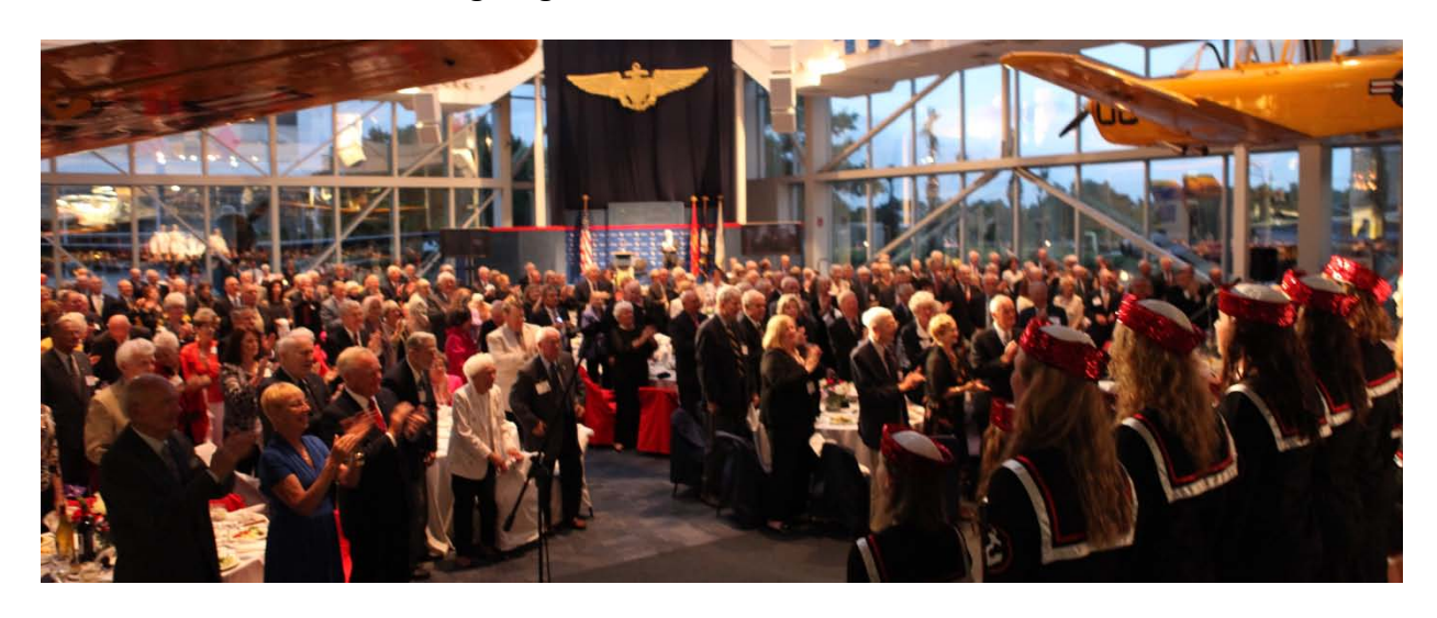
A standing ovation for the Young Singers of the Pensacola Children's Chorus