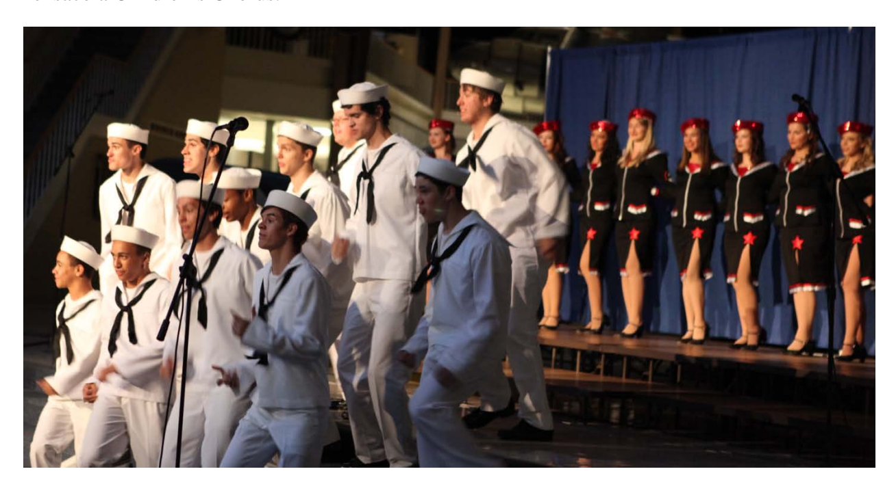
The Young Singers of the Pensacola Children's Chorus

The Golden Eagle Reunion Reception and Banquet was held in the Atrium of the National Naval Aviation Museum. Two hundred and ninety Golden Eagles and guests attended the banquet. One of the highlights of the evening was the entertainment provided by the Young Singers of the Pensacola Children's Chorus.