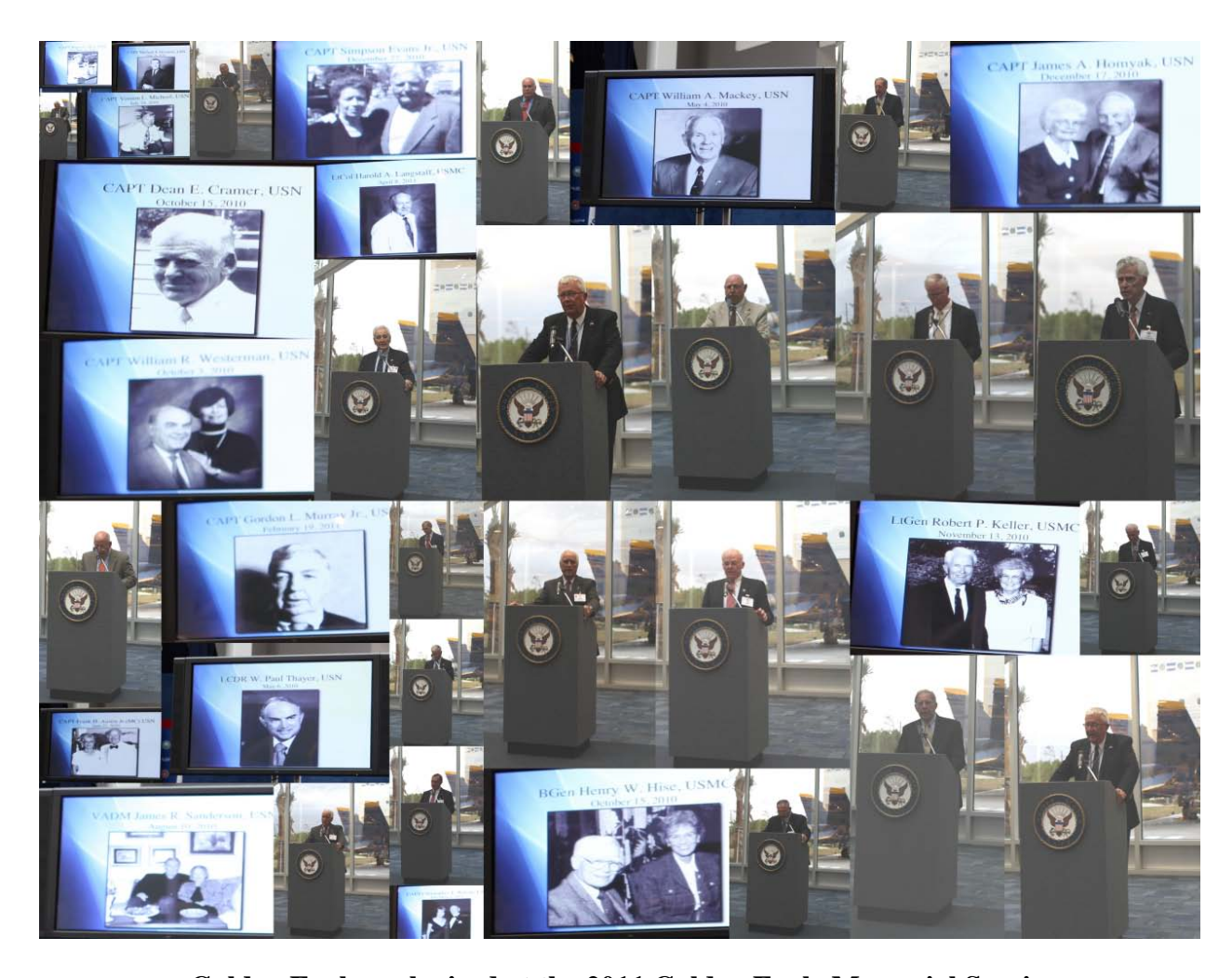
Golden Eagles eulogized at the 2011 Golden Eagle Memorial Service